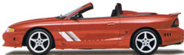
S281 Speedster, shown in Rio Red Tinted Clearcoat.

Offered as the S281 Coupe, Convertible or Speedster, each Saleen Mustang is a handcrafted work of art, a masterpiece of performance and personality.