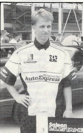
Here's one of Saleen's PPG Indy Car Series shirts, and in front is one of the Saleen Escort Series director's chairs used during 1987-89 Series.